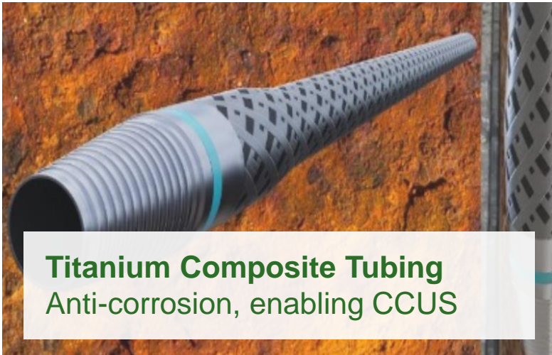
Titanium Composite Tubing Anti-corrosion, enabling CCUS