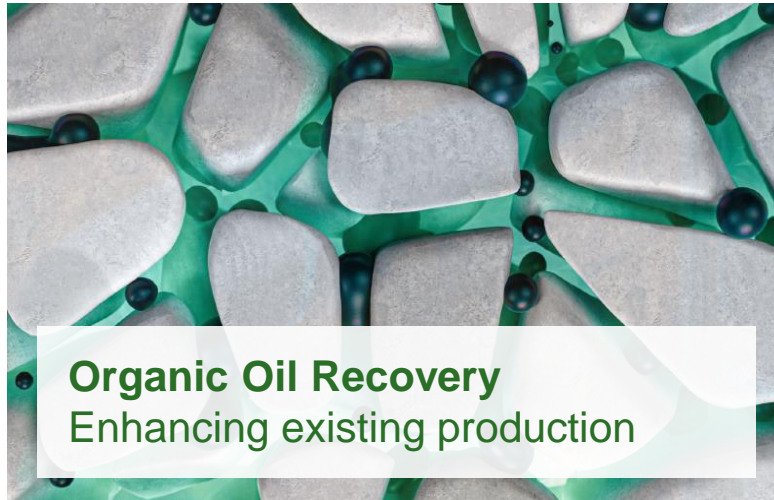
Organic Oil Recovery Enhancing existing production