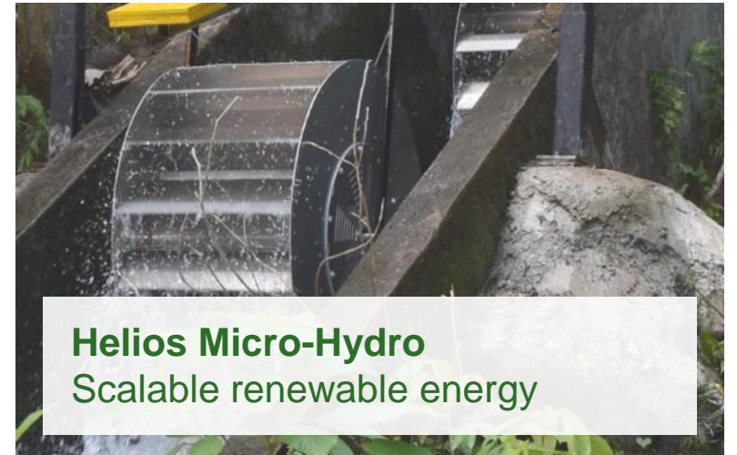
Helios Micro-Hydro Scalable renewable energy