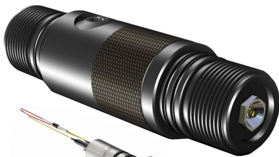
RNSB Retainer Nut

**** Compatible with existing EBFire® Dual Diode Switches