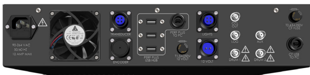
Panel Backside Connections