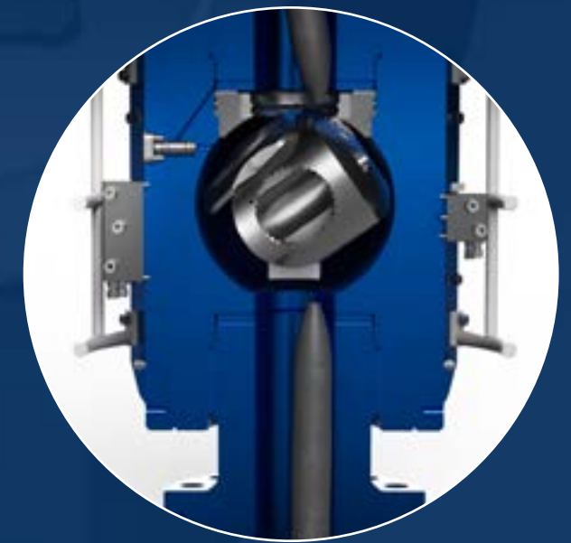
ESSV-HD Shear and Seal Coiled Tubing