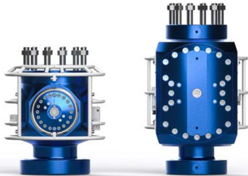
1 Ezi-Shear Seal Valve

Hunting revolutionized well intervention operations with the original shear and seal valve and now offers the heavy duty valve to compliment the product family, offering an expanded range delivering safety, reliability and well integrity for Slickline, Braided Line, E-Line or Coiled Tubing operations.