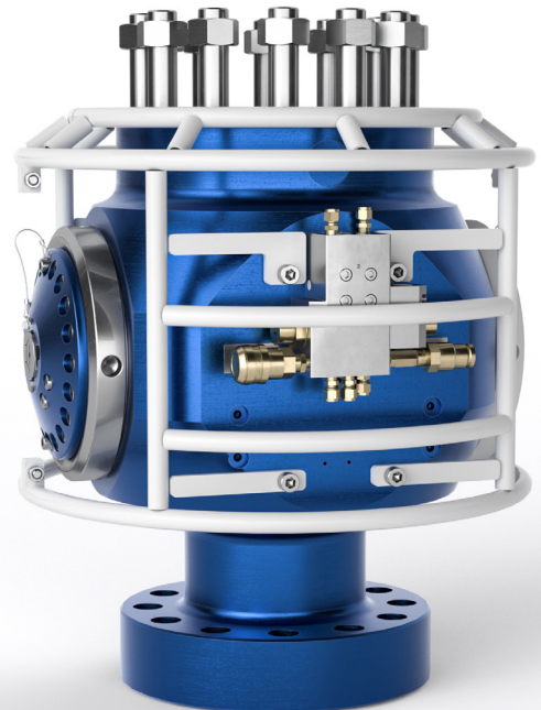
2 Hunting Auto Lock attached to an Ezi-Shear Seal Valve